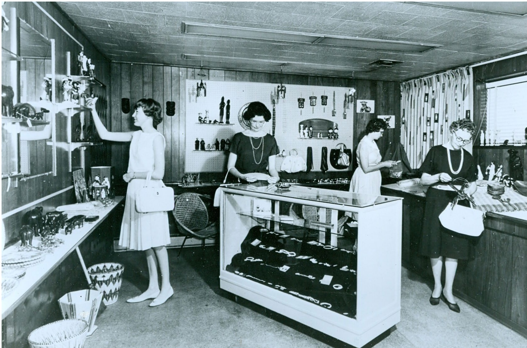
Serrv Gift Shop, 1950

Serrv is recognized as a leader and pioneer in the fair trade movement, with origins in 1949 as one of the first fair trade organizations in the U.S. We were founded by the Church of the Brethren to help European refugees recover from World War II by importing and selling handcrafts.